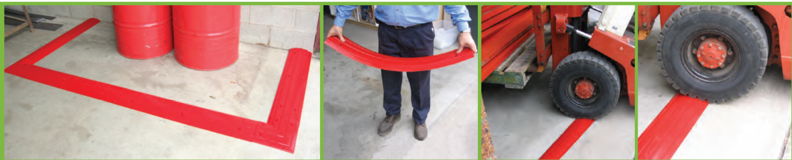
Corner Pieces for easy installation.

DuraBund® is easy to install. Pre-moulded corners are available to allow for installation in virtually any configuration. In addition, installation components including, sealant/adhesive, dynabolts and spacers are available as a kit or as individual components.